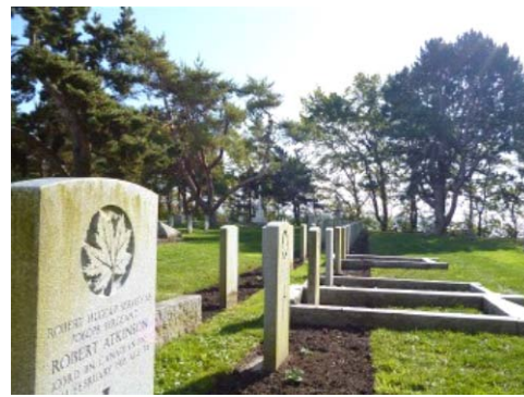
Lest we forget....