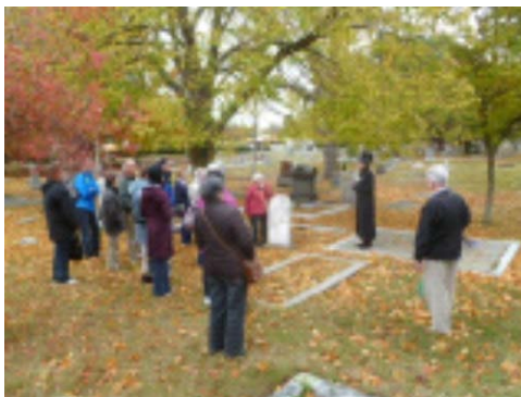
The annual ghost walk....