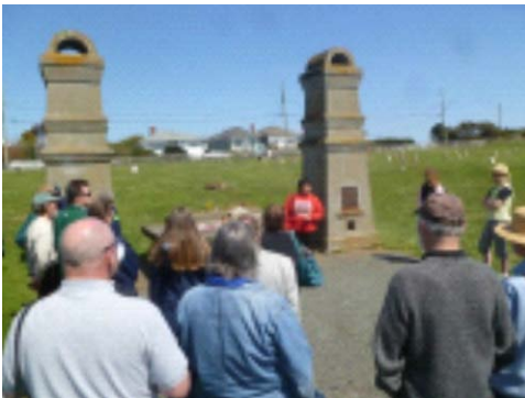
A visit to the historic Chinese Cemetery....