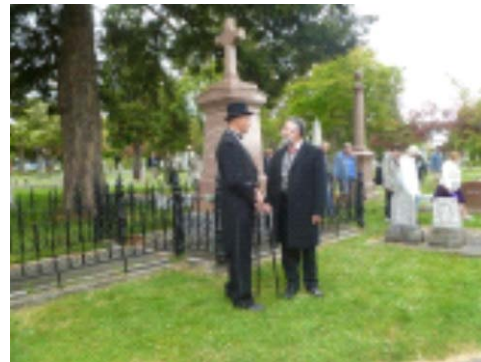
Victorian gentlemen share a word....