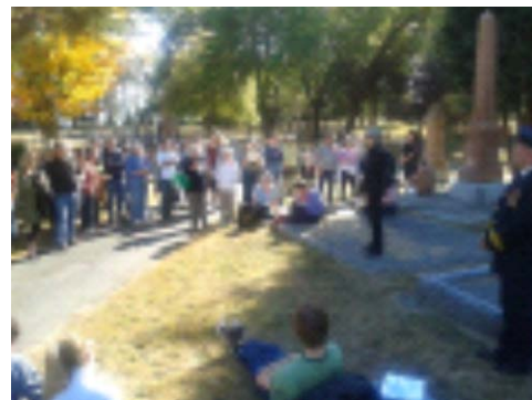
....followed inevitably by fall