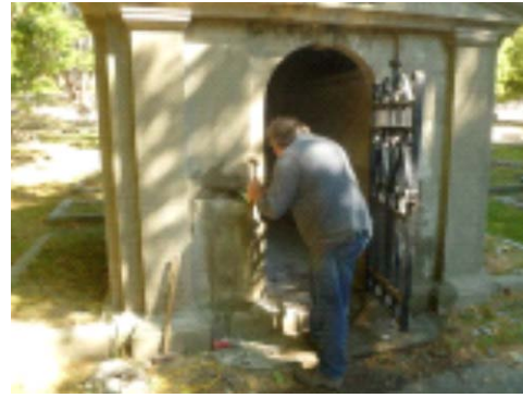
....preparatory to repairing it.