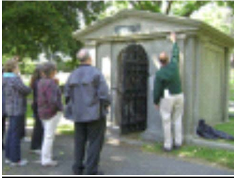
Opening the Houston mausoleum....