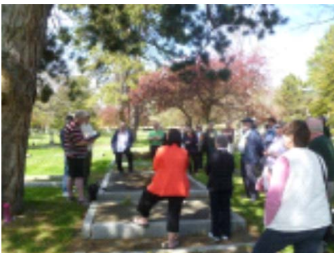
Spring in Ross Bay Cemetery ....